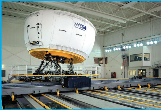
NADS-1 High fidelity motion