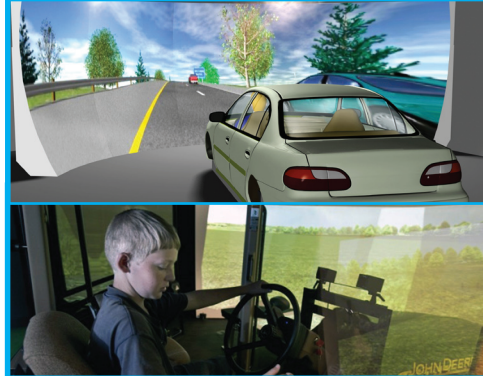
NADS-2 High resolution graphics