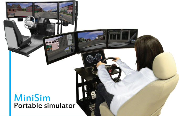
MiniSim Portable simulator